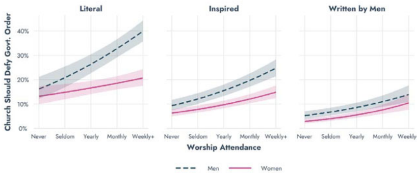
FIGURE 3. How gendered religious worldviews structure defiance of state orders.

Note: Comparison of any two confidence intervals is equivalent of a 90% test of significance at the point of overlap.