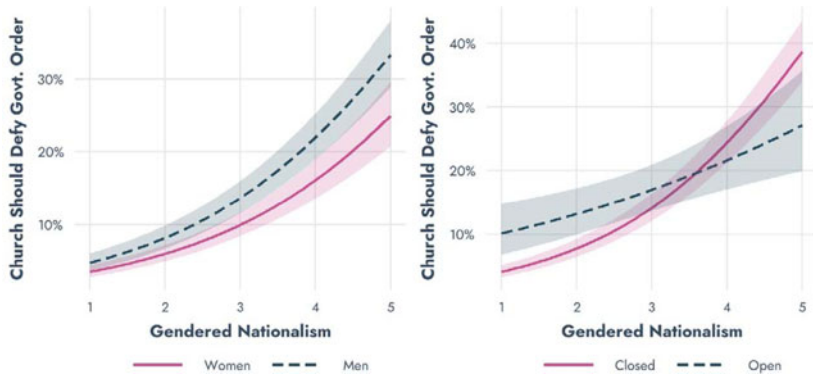
FIGURE 4. Gendered nationalism and defying government orders.